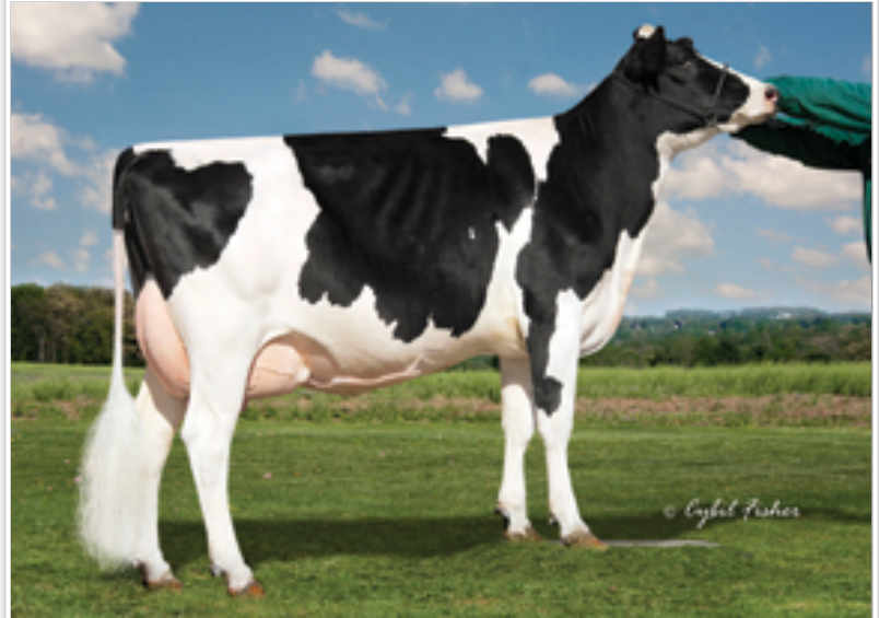
Welcome Domingo Lynx