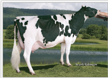
Plez-Vu Domingo 3234