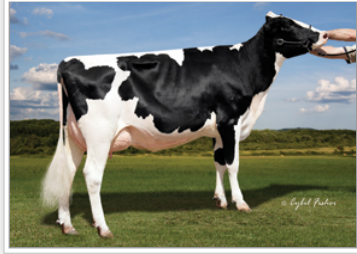
Clear-Echo Domingo 2156